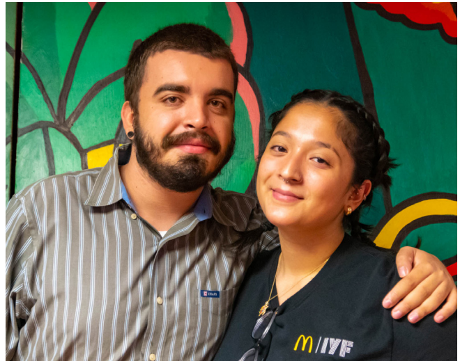
Top: Youth Opportunity Training of Trainers event in Chicago, USA, 2023. Bottom: Latin American Youth Center visit, USA, 2021.