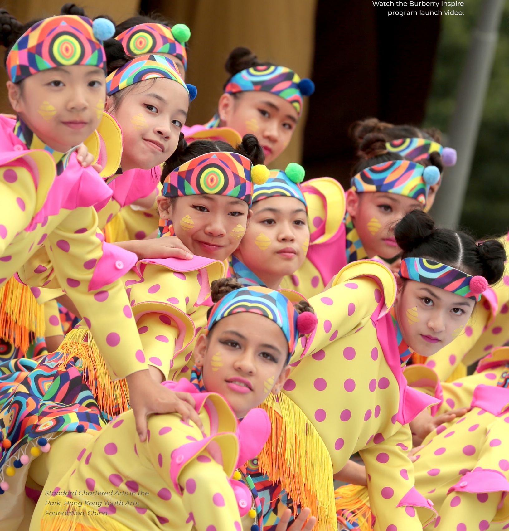
Standard Chartered Arts in the Park, Hong Kong Youth Arts Foundation, China.

Watch the Burberry Inspire program launch video.