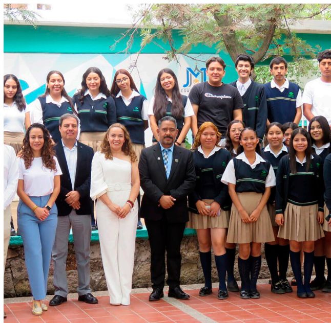
Graduation of young individuals from the Financial and Banking Services program in Aguascalientes, Mexico, 2023.

Today, skills-based hiring is a standard policy among ABM member banks, and the consortium Bécalos-ABM-IYF-developed curriculum is part of the technical upper secondary curriculum in three Mexican states. This initiative has already empowered 2,200 young individuals to participate in the approximately 45,000 entry-level positions that the industry requires each year, with a direct connection to banking institutions, on-site visits, learning sessions with bank personnel, and direct recruitment efforts. The potential impact on the Mexican banking sector and its workforce is immense, bridging the gap between education and employment, opening doors for countless new graduates, and transforming the industry's recruitment practices.