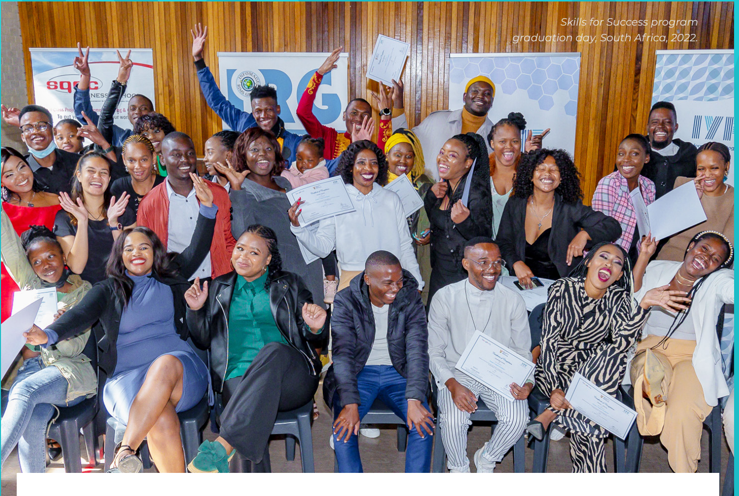
Skills for Success program graduation day, South Africa, 2022.