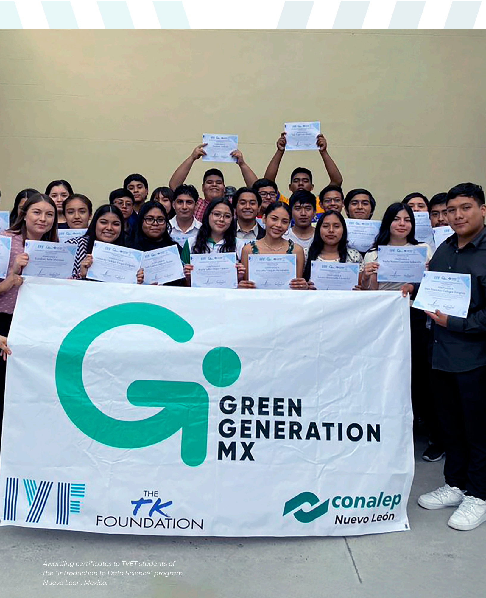
Awarding certificates to TVET students of the "Introduction to Data Science" program, Nuevo Leon, Mexico.