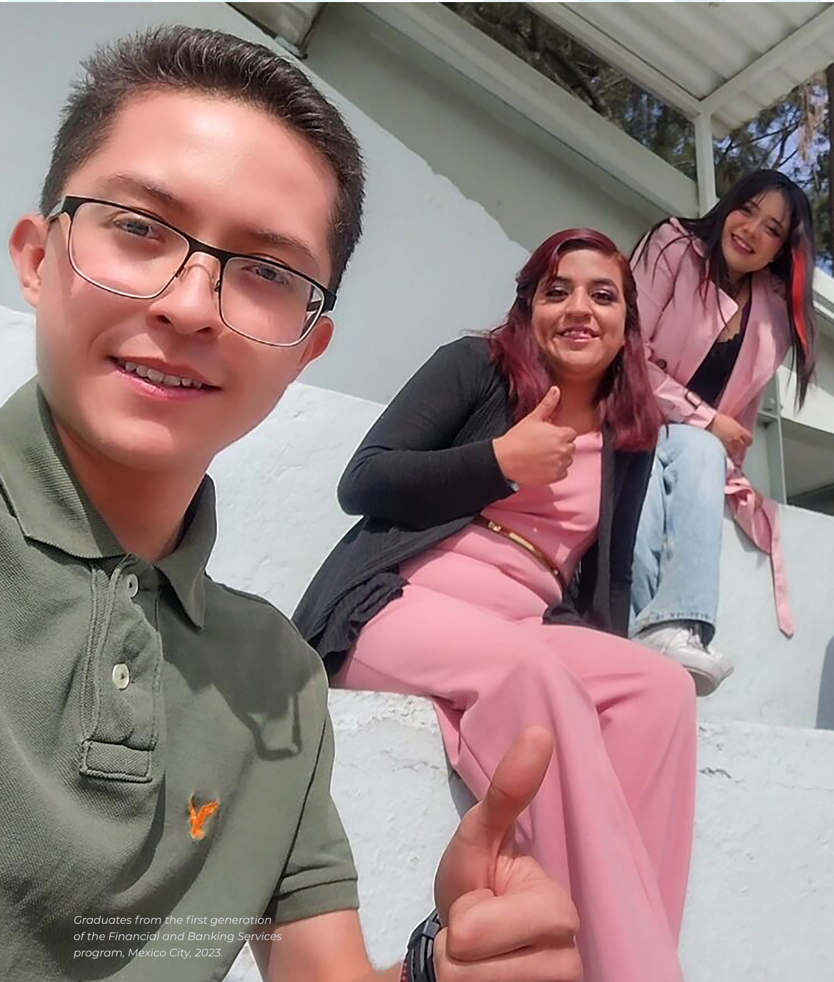
Graduates from the first generation of the Financial and Banking Services program, Mexico City, 2023.