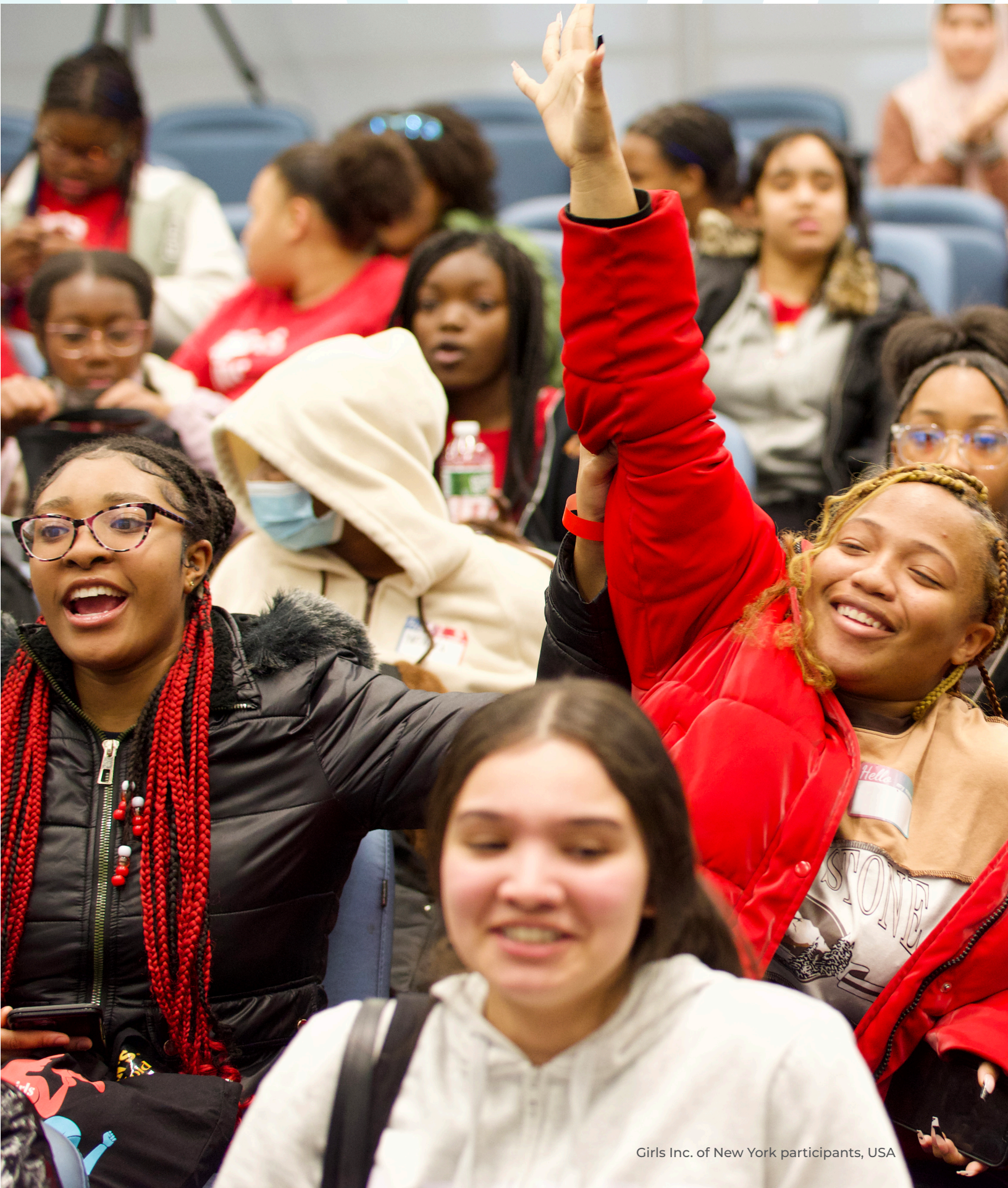
Girls Inc. of New York participants, USA